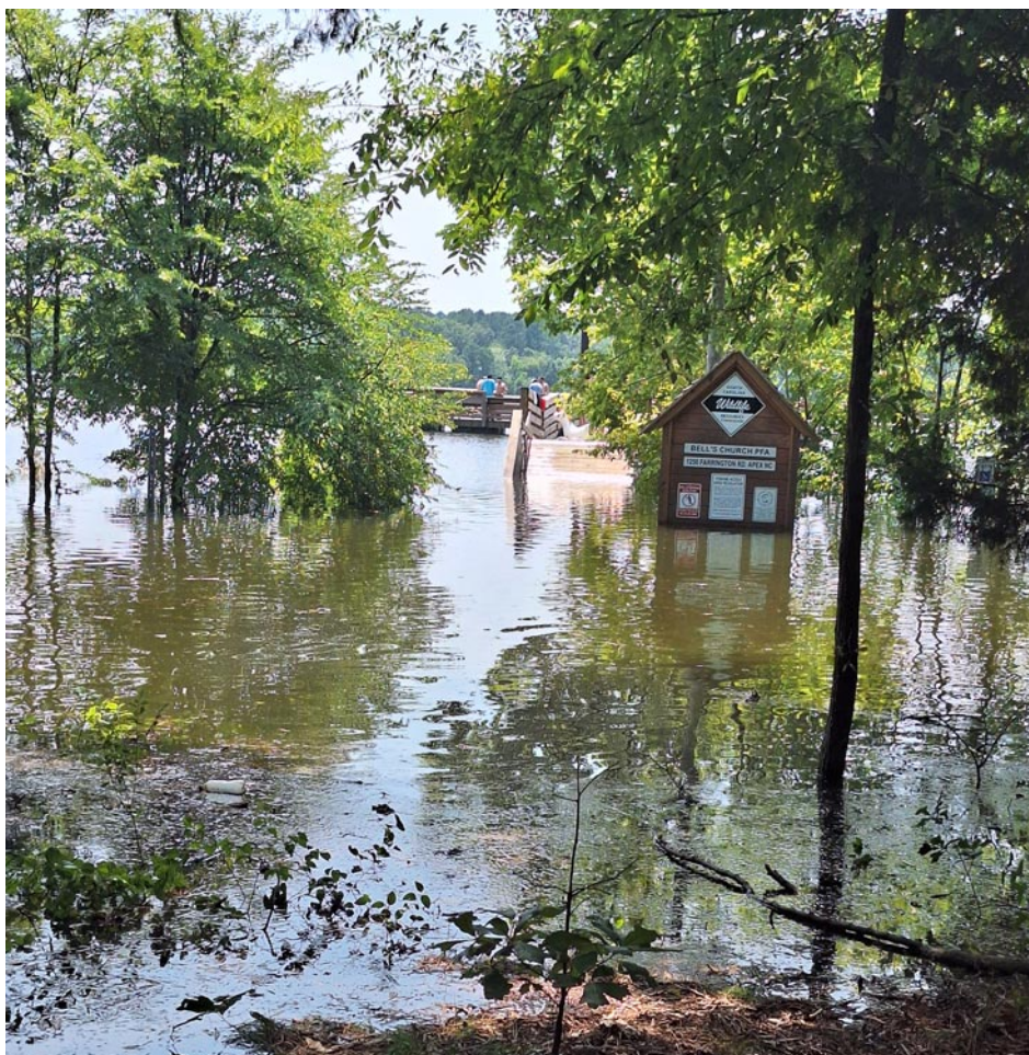
The Bell's Church PFA and fishing pier on Farrington Road in Chatham County were flooded Aug. 11 from the lake to the second parking area.

PROTECT OUR WILDLIFE. Dispose Of Used Fishing Line Properly.