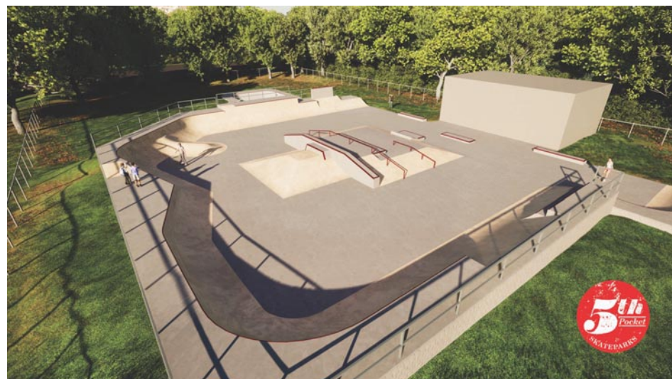
SKATEPARK, Continued from page 1

School athletic officials plan to discuss flag football internally and gauge student interest (there's been some interest expressed) for the 24-25 or 25-26 school year and perhaps encourage forming a flag club. The district, which offers 22 varsity sports, among the most in the state, recently cut 81 positions due to falling enrollment and a budget shortfall.