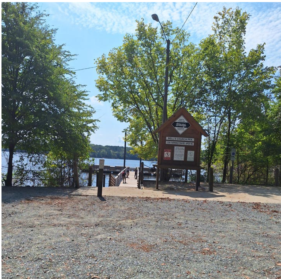
Fishers, individuals and families, were back three weeks later at Bell's Church Sep. 1. It's the lake's only handicap-accessible pier and has fish attractor lights for night fishing, maintained by N.C. Wildlife Resources Commission.

Remember, entrance fees at day use areas are charged weekends-only in September.