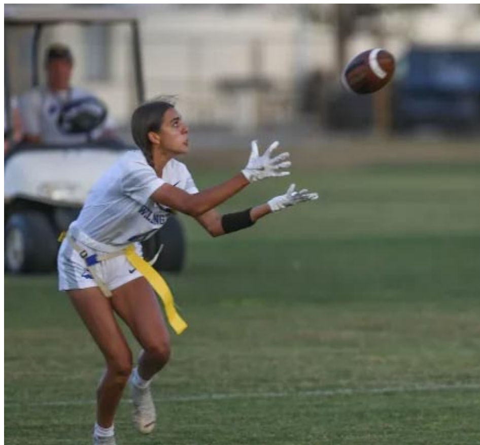
Girls flag football is growing in the state of North Carolina.

SIGN UP FOR CSN NEWSLETTER TODAY at community-sports-news.com