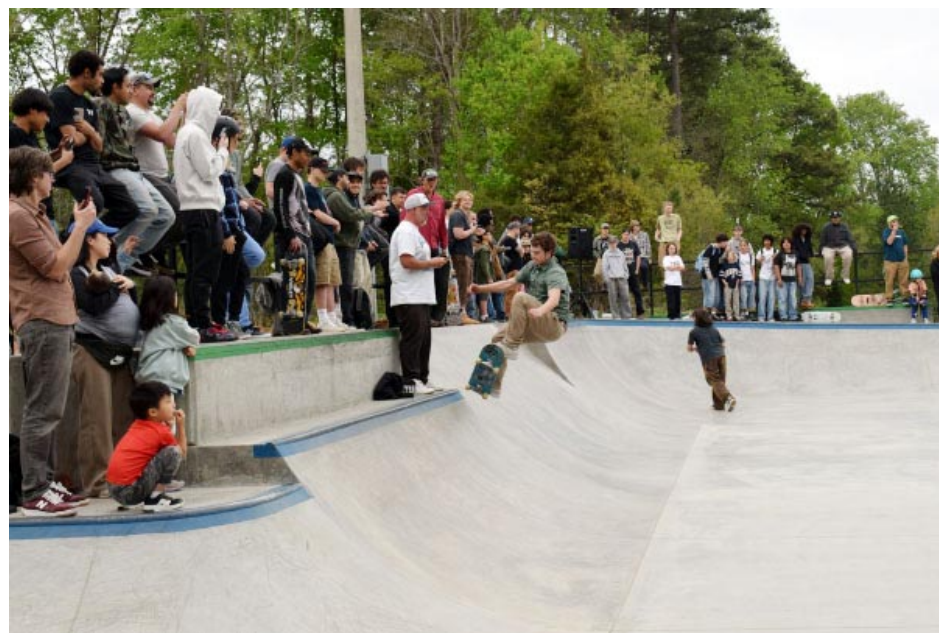
The Homestead Park lot was jammed for the grand "reopening" of the upgraded Chapel Hill skate park. The changes were designed by boarders, rebuilt with concrete, reopened in late fall but the celebration was delayed until spring and warm weather. Young and old enjoyed the action.