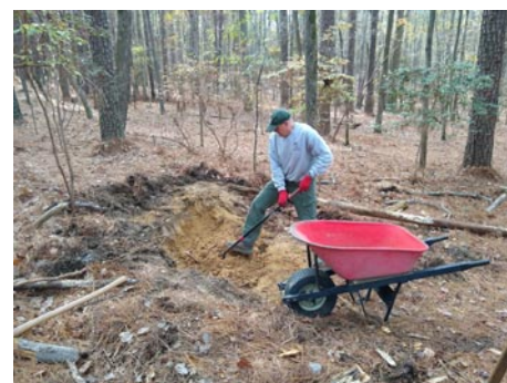
The new bridge made it easier for volunteers to continue trail repair work at Brumley South.