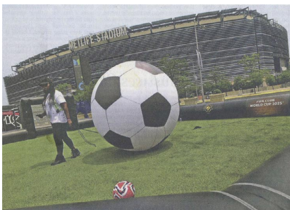
New York/New Jersey Stadium (Met Life) will host the 2026 World Cup championship Sunday, July 19, at 3 p.m. on Fox/Telemundo.