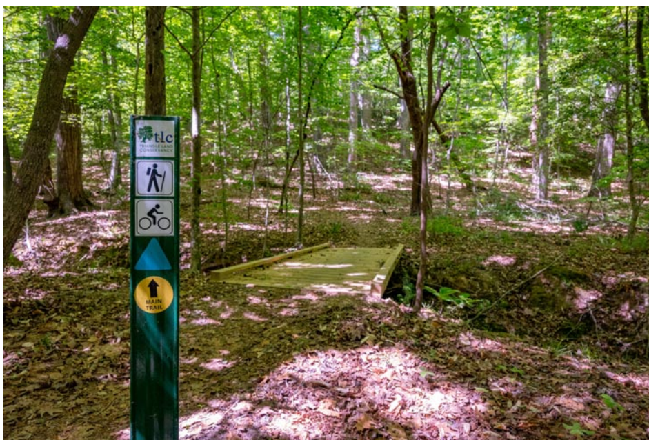
TRIANGLE LAND CONSERVANCY

Most facilities will be closed Juneteenth, July 4 and Labor Day.